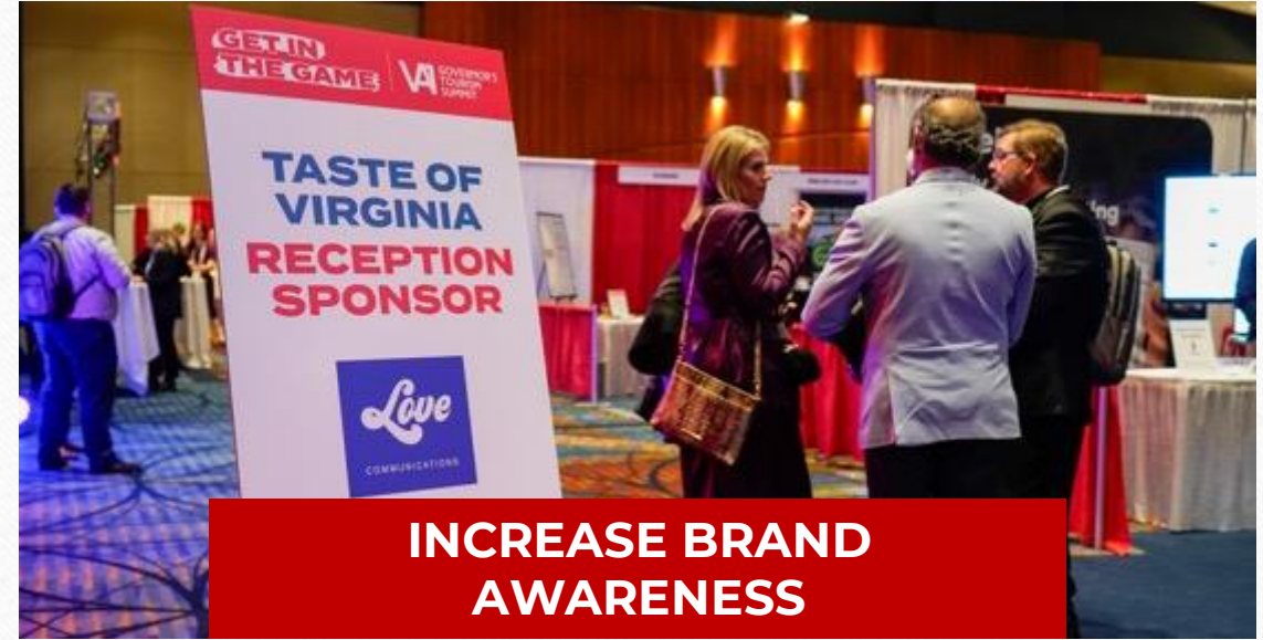
INCREASE BRAND AWARENESS