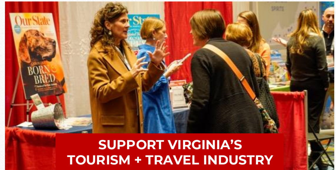
SUPPORT VIRGINIA'S TOURISM + TRAVEL INDUSTRY