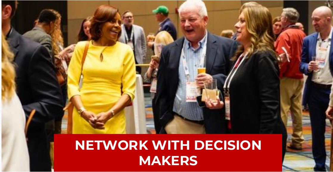
NETWORK WITH DECISION MAKERS