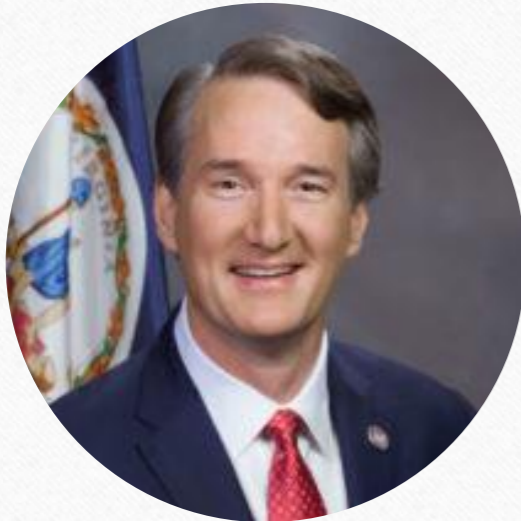
Virginia Governor Glenn Youngkin