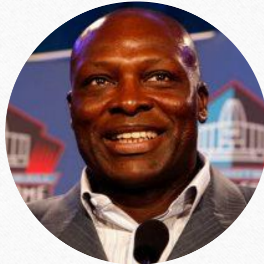
Bruce Smith NFL Hall of Fame Defensive End & Virginia Hotelier