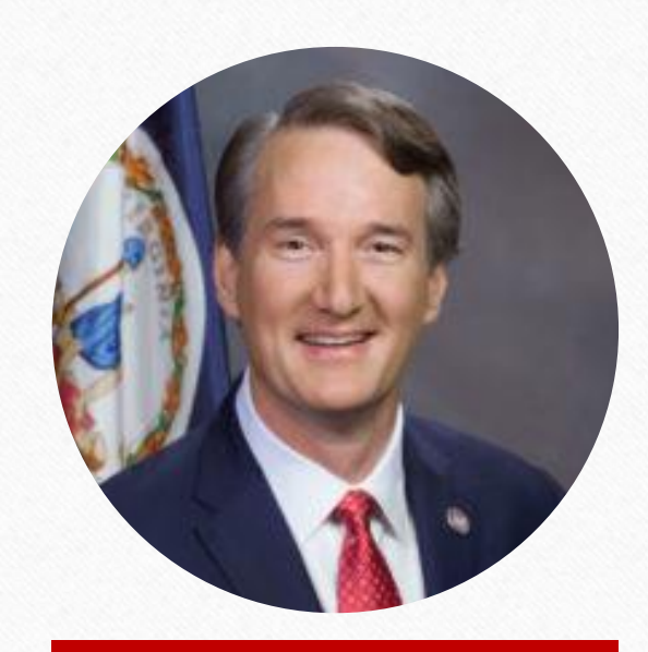
Virginia Governor Glenn Youngkin